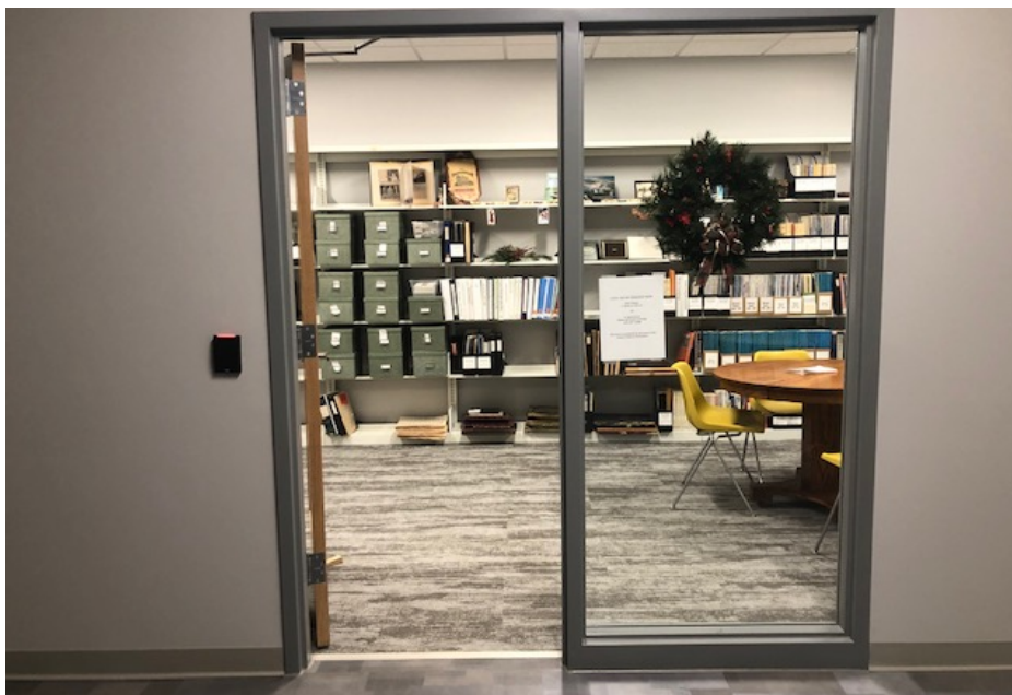
LOCAL HISTORY ROOM

The History Room is equipped with computers and a printer. None of the books or records are allowed to leave the room but we can make copies of nearly everything.