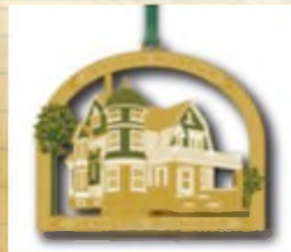
2012 1st Annual Ornament

We will have a booth at the Grandville-Jenison Chamber Community Expo on October 27th . Join us to network with the Community and local businesses.