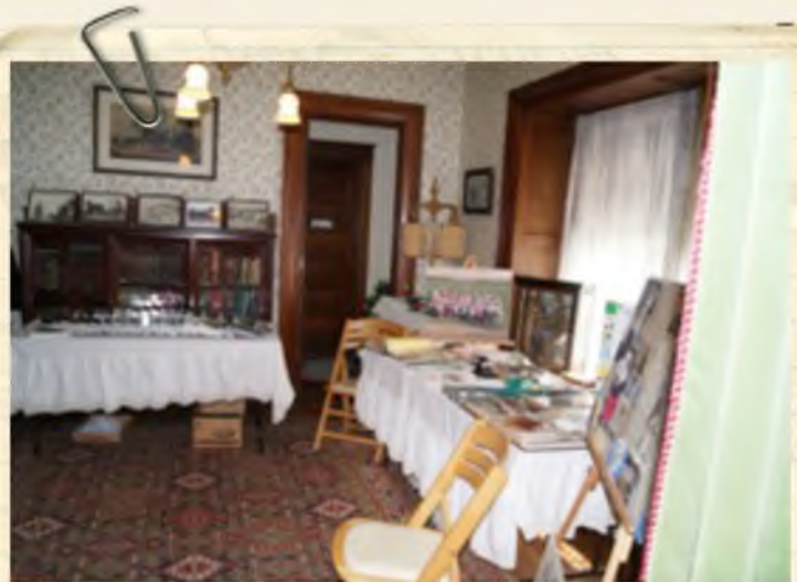
September Open House - Jenison High 'Reunion' showing items from 1969 thru 2011

These will make great gifts for family and friends!